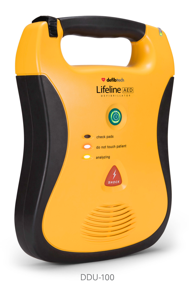
MEDICAL DESIGN EXCELLENCE AWARDS®

Lifeline AED Semi-Automatic Defibrillator